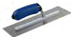
1/8" "V" Notch Trowel