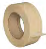
2" Masking Tape