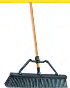
Stiff Bristle Push Broom